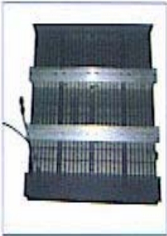
600 x 600 x 105mm (WxHxThickness)